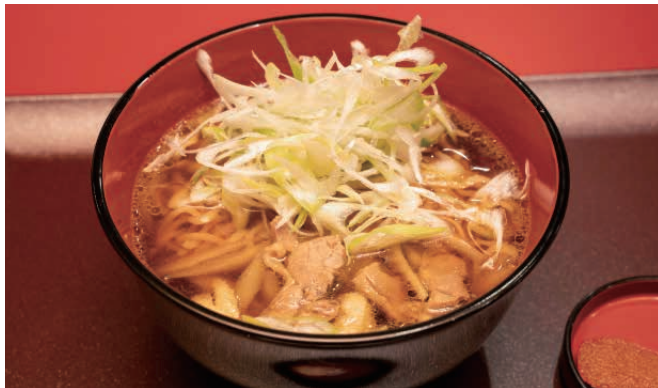
【 Aizu Chicken ramen 】

We would like to announce a restaurant participating in this year's Aizu Shoku no Jin. Winter's theme ingredient is "Aizu Chicken."