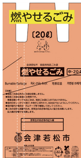
Burnable Garbage (Orange)

▶ Contact: Environmental Policy Division ( ☎ 27-3961)