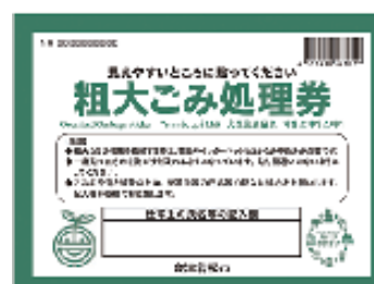
Oversized Garbage Sticker