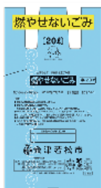
Designated Garbage Bags