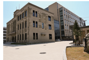
Old Building Plaza