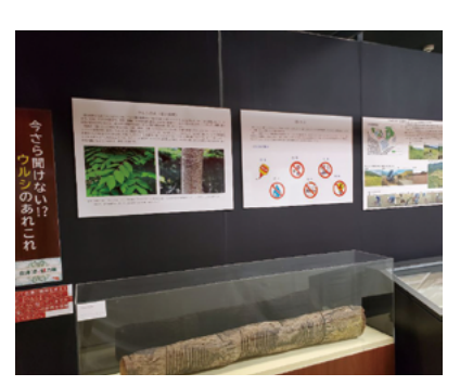
Aizu Lacquerware Exhibition: Experience the variety of charms of Aizu Lacquerware.