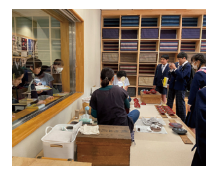
Lacquerware Open Studio: You can see the making of lacquerware projects up close and personal.