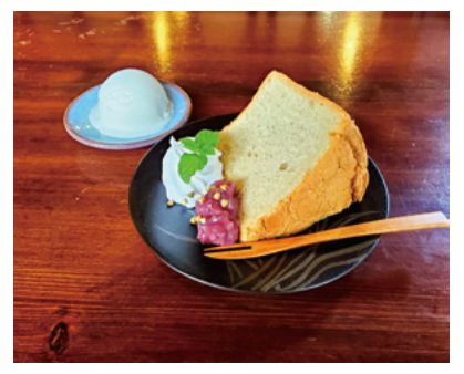
Collab Dessert: Come taste the collaboration of sweets and lacquerware pieces.