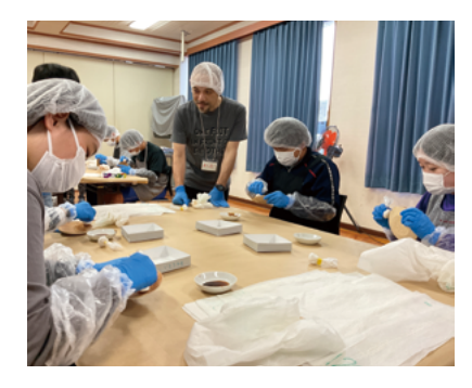
Colour~IRODORU~Project: Come see the children's art!