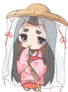
Minazuru-hime and Yoshitsune Sub Design