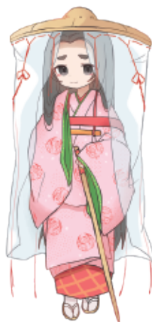
Minazuru-hime and Yoshitsune Main Design