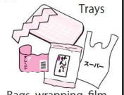
Bags, wrapping, film