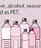
① Remove the bottle cap and label.