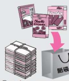
④ Other waste paper (magazines, publications, miscellaneous recyclable paper)